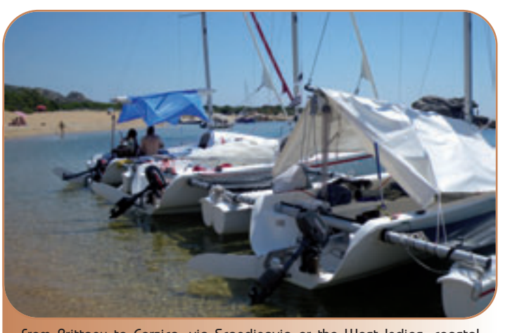
From Brittany to Corsica, via Scandinavia or the West Indies, coastal camping is fantastic!