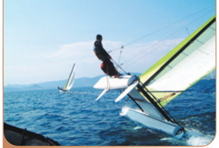
Any old sport catamaran will be good enough to use for a raid... And in addition, you will be able to have fun between two bivouacs!

you sail along the coast in your little multihull (it works with a monohull too, but it's not as nice...). As its accommodation is often reduced to the simplest form, the only solution when you stop is to pitch a tent, either on the beach or on the boat's trampoline. This way of sailing has (very) many advantages: you can change your cruising area at will, as these boats are easily transportable, they are not expensive, either to buy or maintain, and cruises are quite franklu economical - no marinas and no excessive provisioning... In short, a leisure sailor's delight!