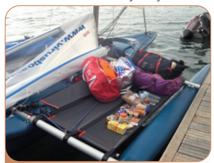
Before leaving, you will have to stow all the food and camping equipment aboard. Not always simple!

several sport catamarans specially designed for coastal raids. There is the brand-new Hobie Pearl, and, especially, the Aventura 20, which has just been launched. With its wings, its big watertight lockers in each