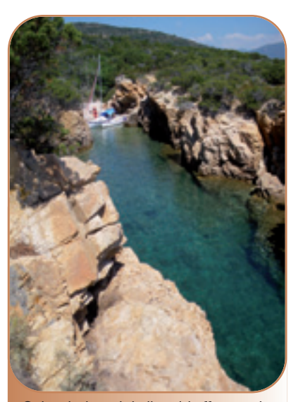
Only a little multihull could offer you the possibility of this type of anchorage.

The formula's advantage is that no destination is excluded... With the boat on the trailer, you can go anywhere you want to, from your 'home port'. Even the other side of the sea, if you organise your boat's transfer early enough. Once at your destination, all you have to do is leave the car and the trailer in a