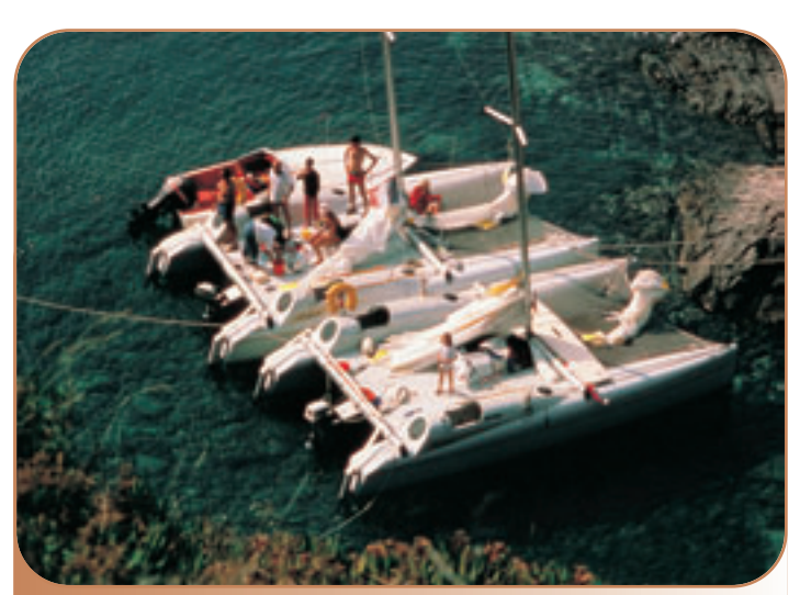
Aboard these two Corneel 26s, a group of friends are certainly spending their best holidays ever.

Half-way between the excitement of a sport catamaran and the liveability and comfort of a raid catamaran, there are the trimarans. The Virus Magnum 21, Astus 22.1, Tricat 22 Raid, Tricat 23.5, Multi 23 are machines which are fun to sail and will also take a good load, including a family with all its camping equipment... Easy to dismantle, and transportable on their trailers, these trimarans allow you to envisage multiplying the cruising areas, whilst offering much better comfort than the sport catamarans. The